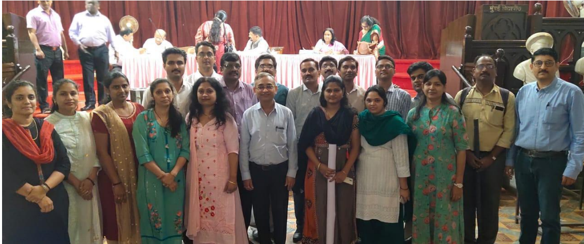
Faculty at Convocation Hall, University of Mumbai, Fort Campus Makerthon