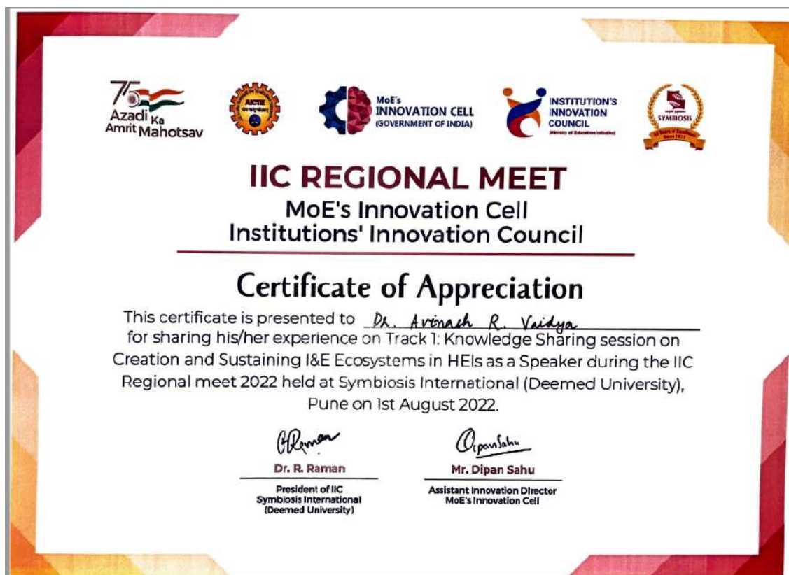
Certificate of Appreciation