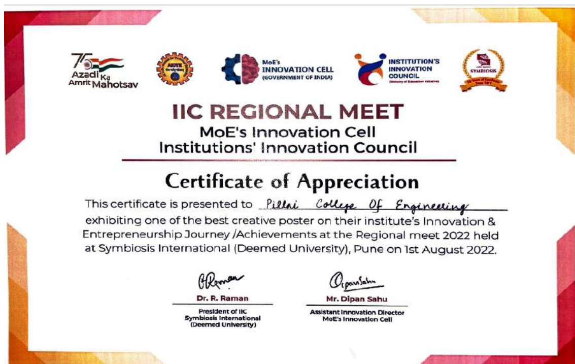
Best Creative Poster Certificate