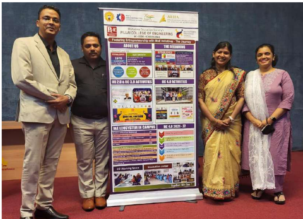
PCE Representatives with Poster