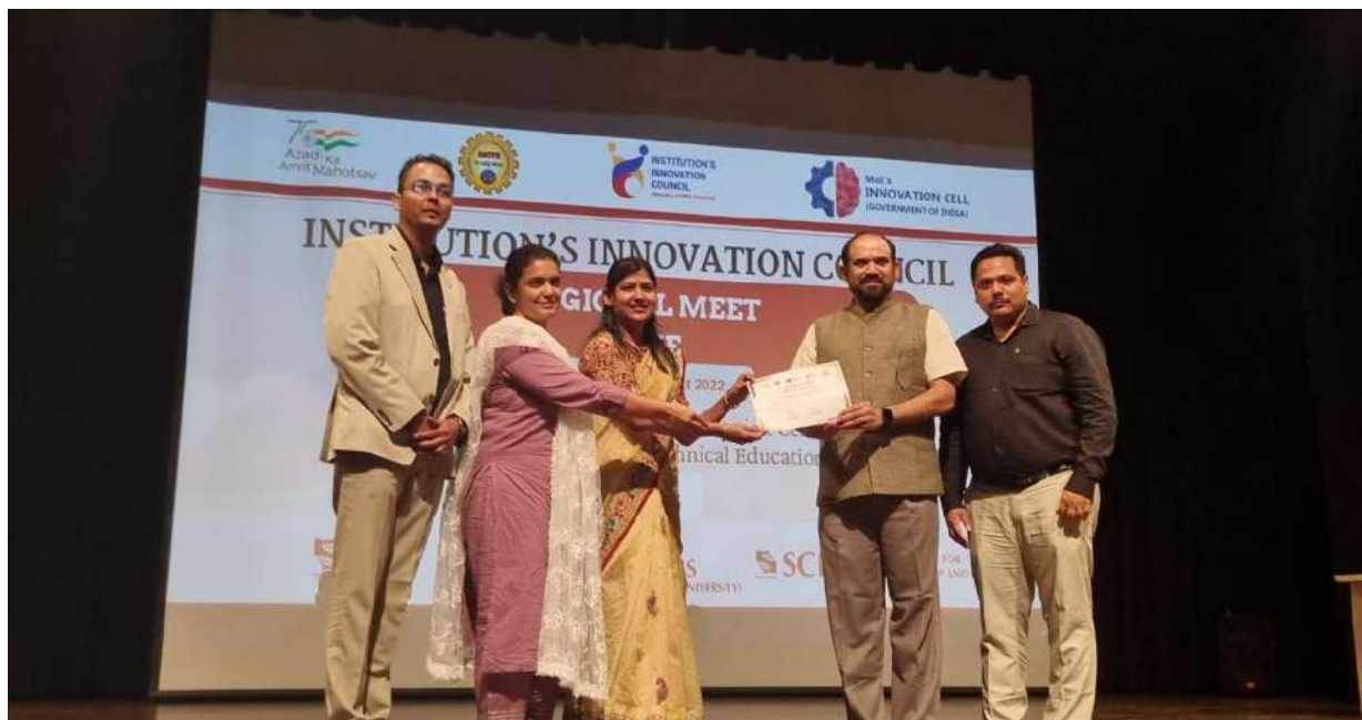
PCE Representatives receiving Best Creative Poster Award